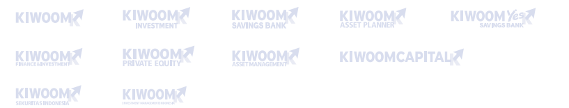
As of February 2024