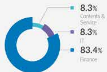
(Revenues by business segment)

Consolidated financial results for FY 2021, Exchange rate $1=W1,190.50, USD as of Dec 31st, 2021